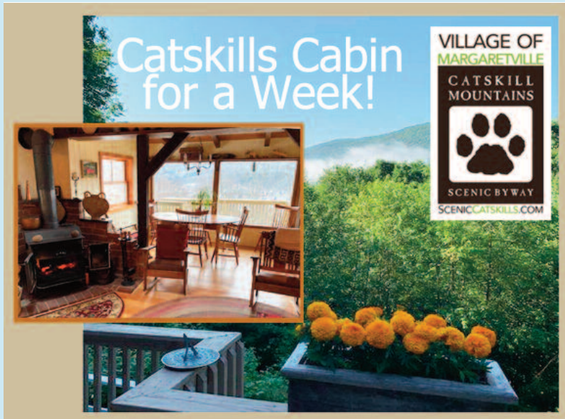
#425 Catskills Cabin