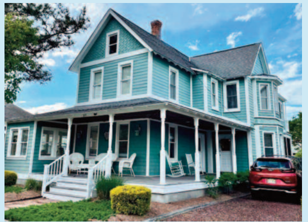
#404 Rehoboth Beach House