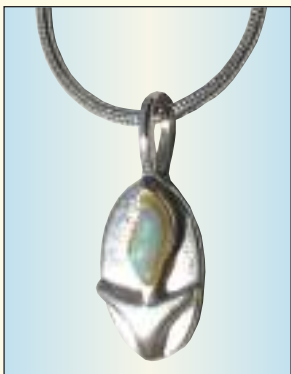
#521 ChaliceArt Mini Pendant