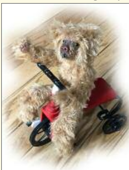
#507 June Bear Riding Tricycle