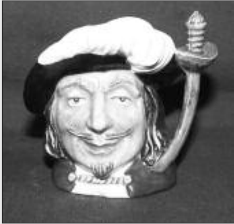
#557 Mini Mug/Jug with Porthos