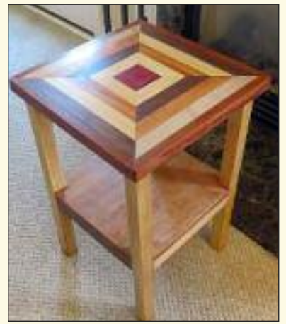
#522 Handcrafted Table