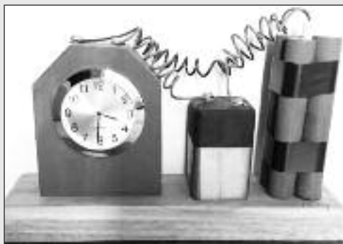
#505 Dynamite Quartz Clock