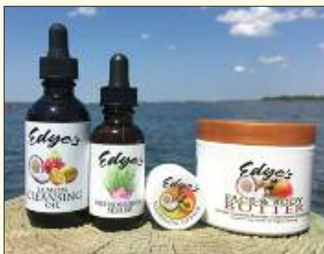
525 Edye's Naturals Skincare