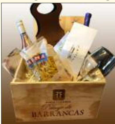
#700 Cattani Kitchen & Catering Gift Card Package