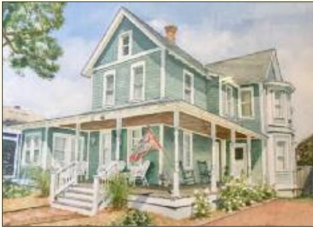
#412 Rehoboth Beach House