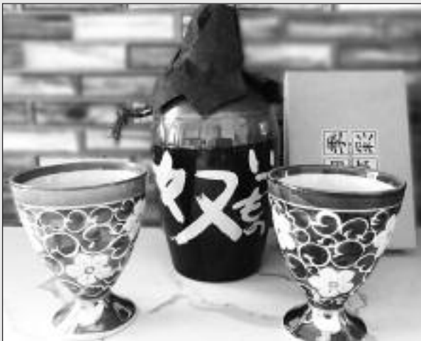
#558 Arabesque Sake Cup Set