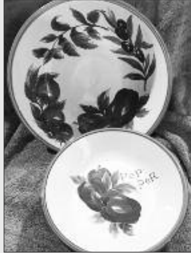
##529 Five Piece Pasta Set