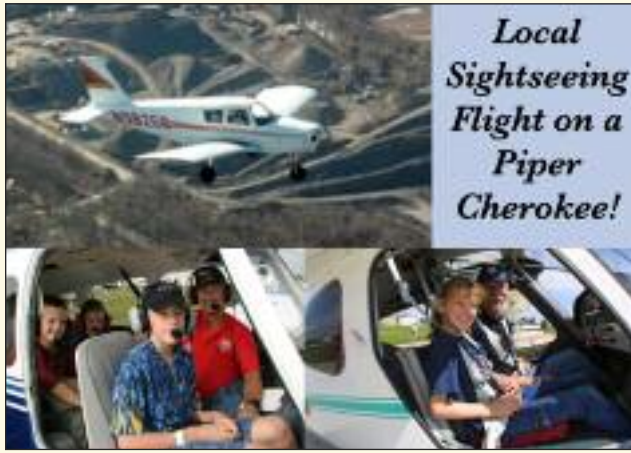
#410 Private Airplane Sightseeing Flight