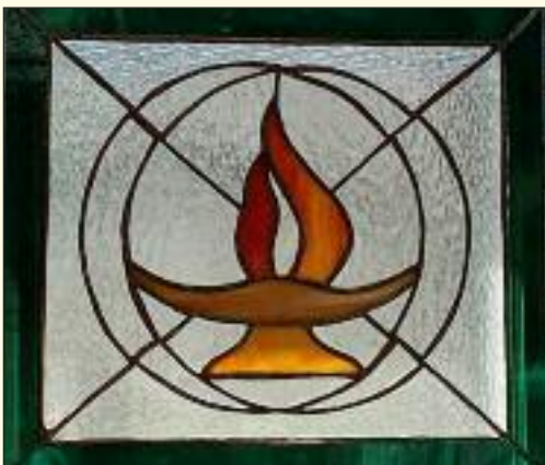
#523 Chalice Stained Glass