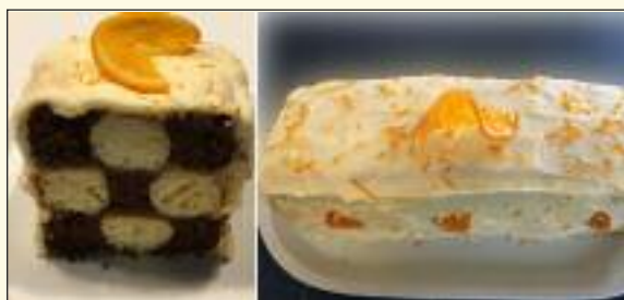
#252 Checkerboard or Custom Cake