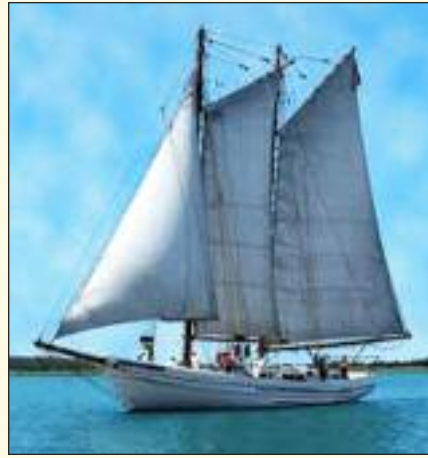
#220 Sail the A.J. Meerwald