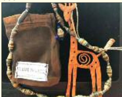
#553 Zimbabwe Bead Necklace