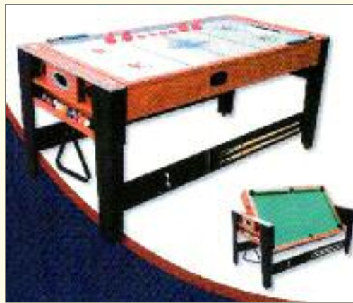
#518 Game Table by Sportscraft