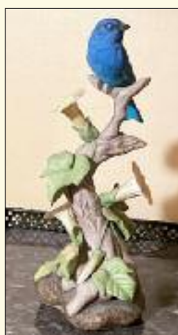
#545 Indigo Bunting Porcelain Figurine