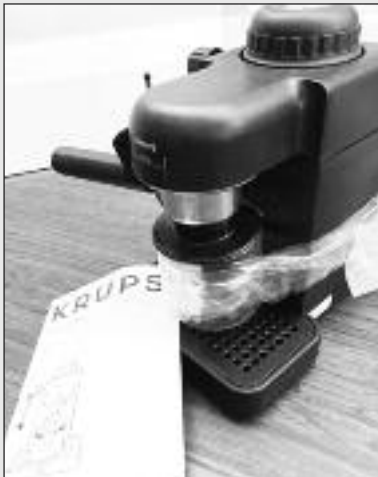
#568 Krups Mini Espresso