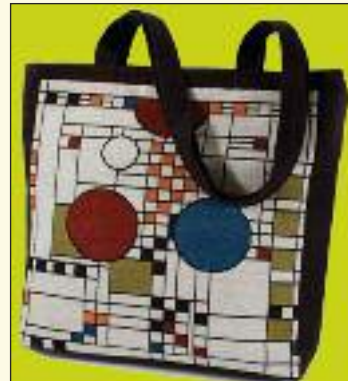
#527 Frank Lloyd Wright Tote