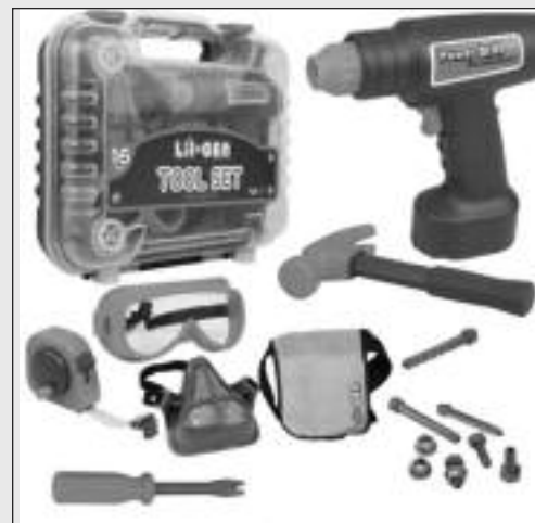
#510 Child's Play Tool Set