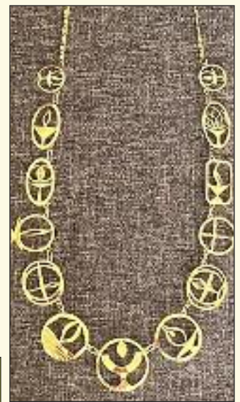
#517 UU Chalice Necklace