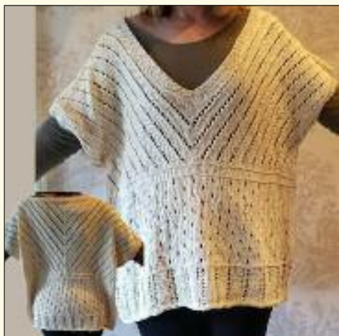
#526 Handknit Sweater