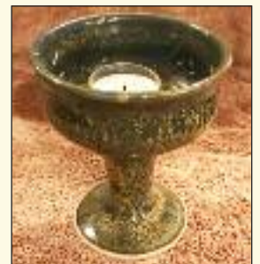
#538 Ceramic Chalice