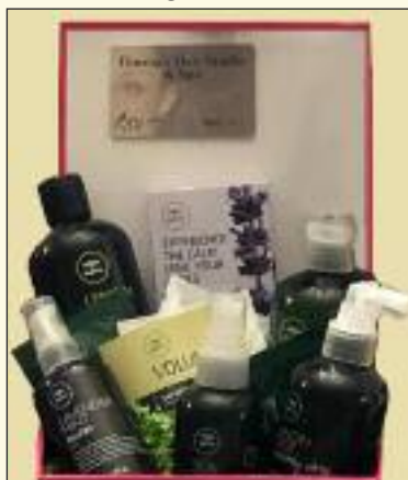
#519 Paul Mitchell Products and $50 Gift Card