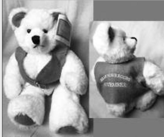
#508 Teddy Bear for a Cause ACS