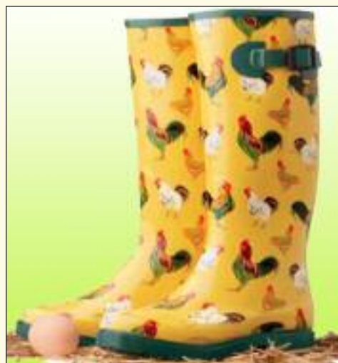
#569 Wellies Garden Boots