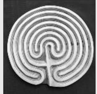
#503 Finger Labyrinth