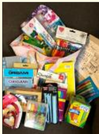
#543 Creativity Bundle