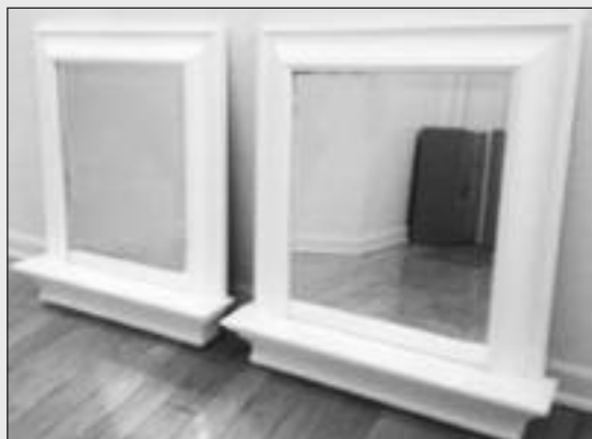
#501 Matching Mirror Set