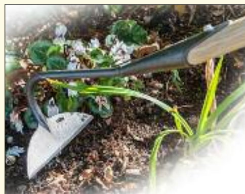
#544 Swan Neck Hoe