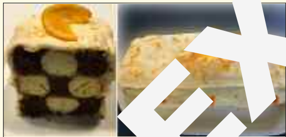
#252 Checkerboard or Custom Cake