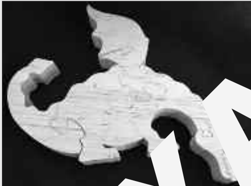
#506 Handmade Dragon Puzzle