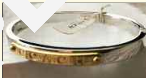
#551 Cosh Silver Bracelet