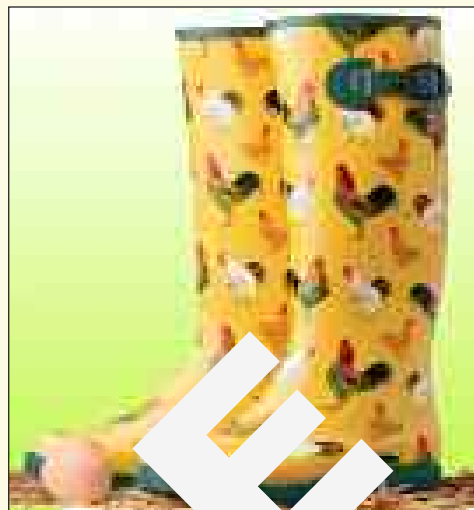
#569 Wellies Garden Boots