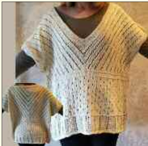
#526 Handknit Sweater