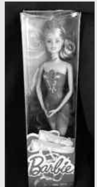
#504 Barbie Ballerina