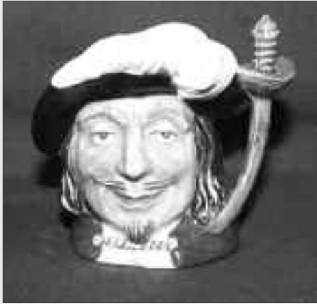
#557 Mini Mug/Jug with Porthos