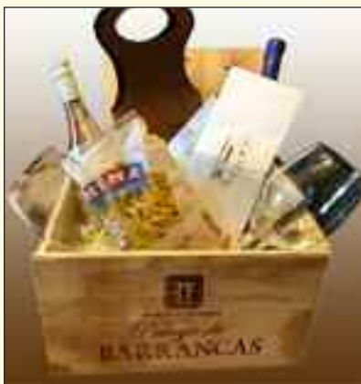
#700 Cattani Kitchen & Catering Gift Card Package