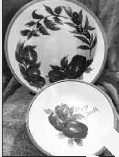
#529 Five Piece Pasta Set