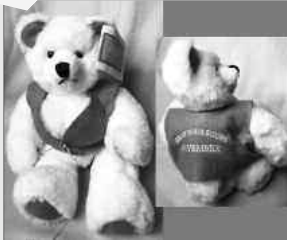
#58 Teddy Bear for a Cause ACS