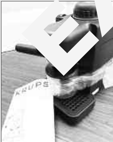
#568 Krups Mi...