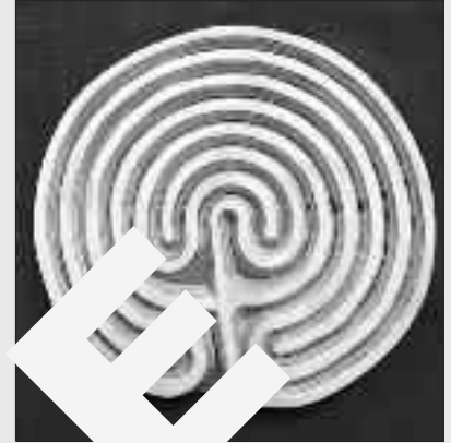
#503 Finger Labyrinth