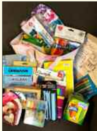
#543 Creativity Bundle