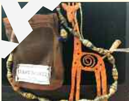
#32... Bead Necklace