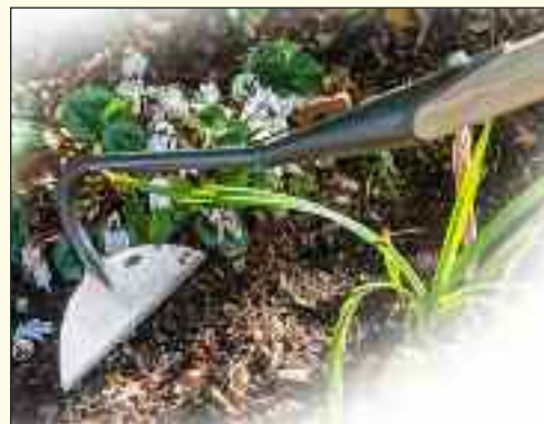
#544 Swan Neck Hoe