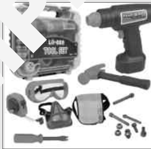
Lo-ore Ch... ay Tool Set