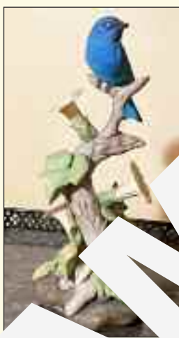
#545 Indigo Bunt Porcelain Eggs