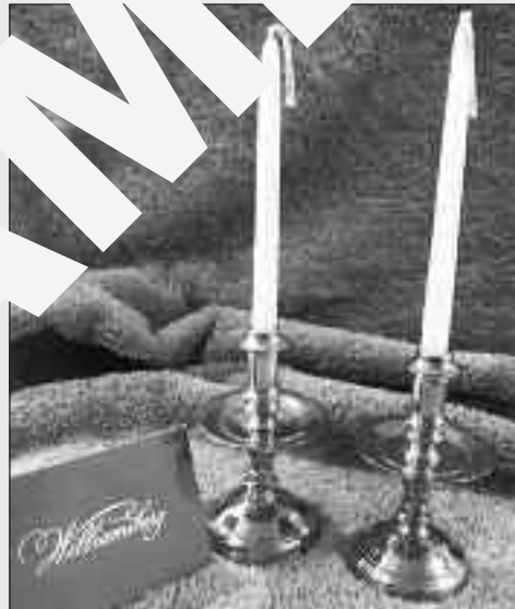
#537 Colonial Williamsburg Glass Candles