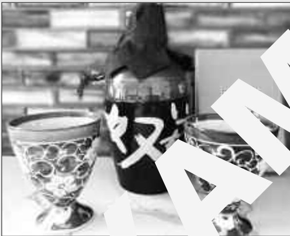
#558 Arabesque Sake Cup Set