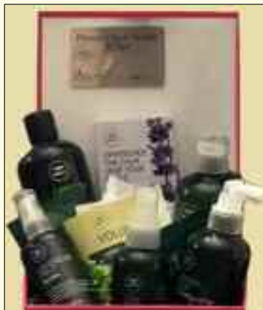
#519 Paul Mitchell Products and $50 Gift Card