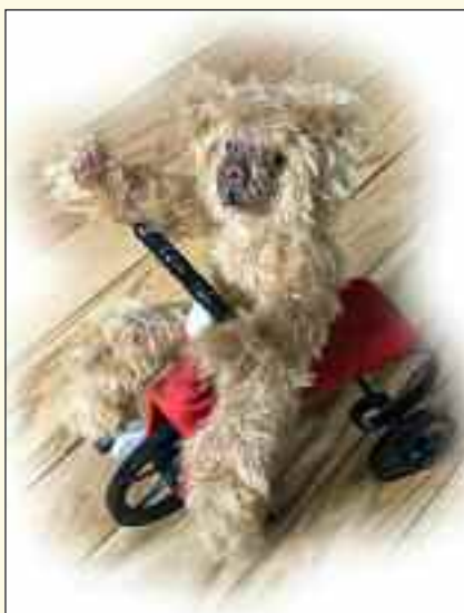
#507 June Bear Riding Tricycle